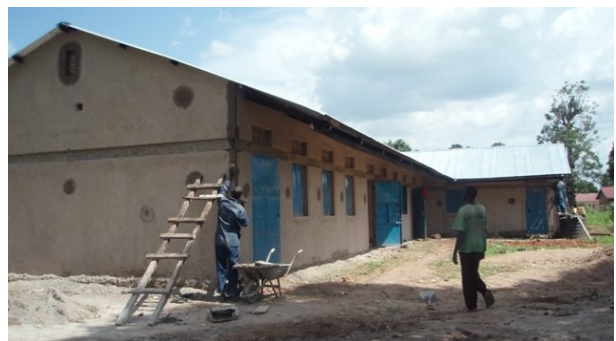
Construction of the Immanuel nursery school

I hope that such training like this should aim at high quality service-learning, a good tutor-children relationship and care and making connection between schools and communities. There is a great desire to develop family, school and community partnership practices in poor community schools in Yei.