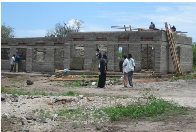
Construction of primary school Panyana